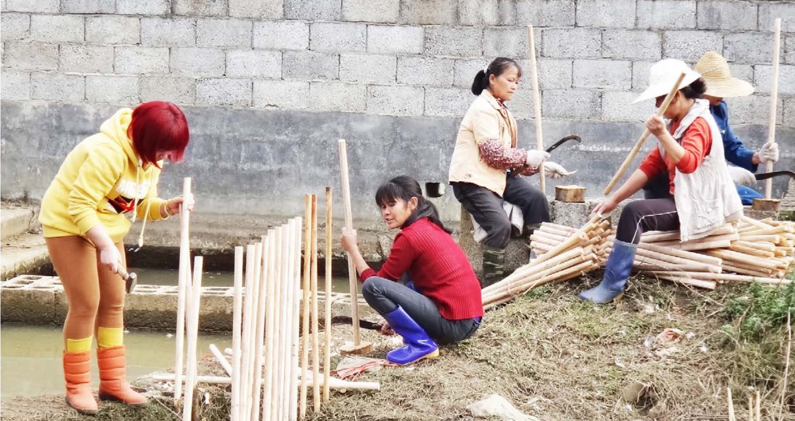
Rural women in Debao County, Guangxi Zhuang Autonomous Region carry out a service project to protect water resources