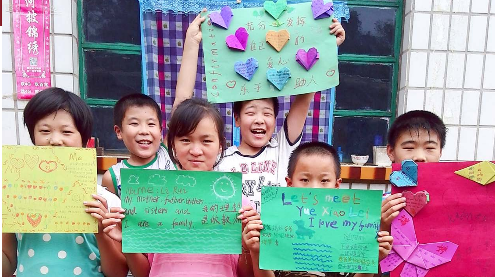
Junior youth in Wuyi County, Hebei Province share their art projects