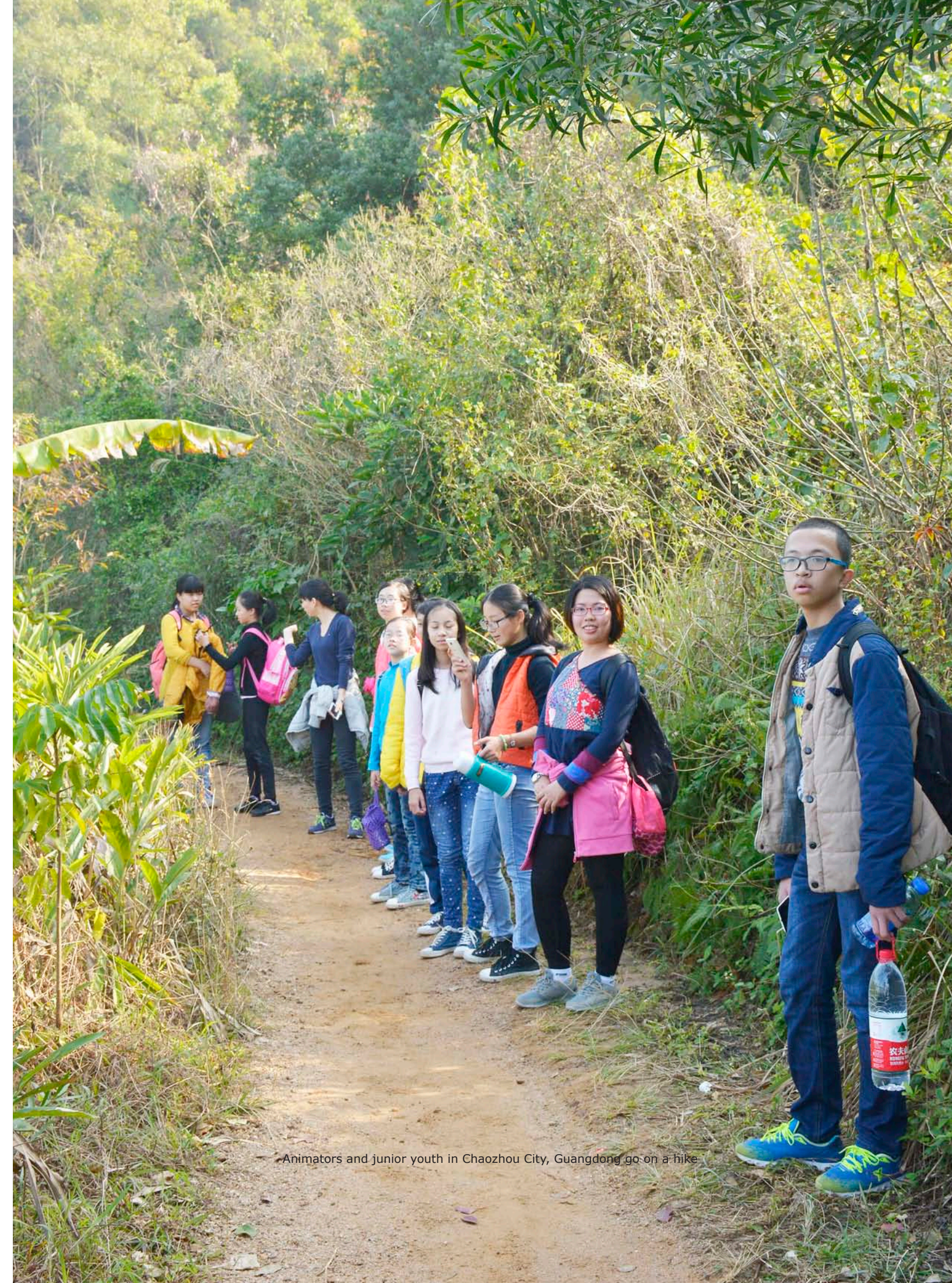
Animators and junior youth in Chaozhou City, Guangdong go on a hike