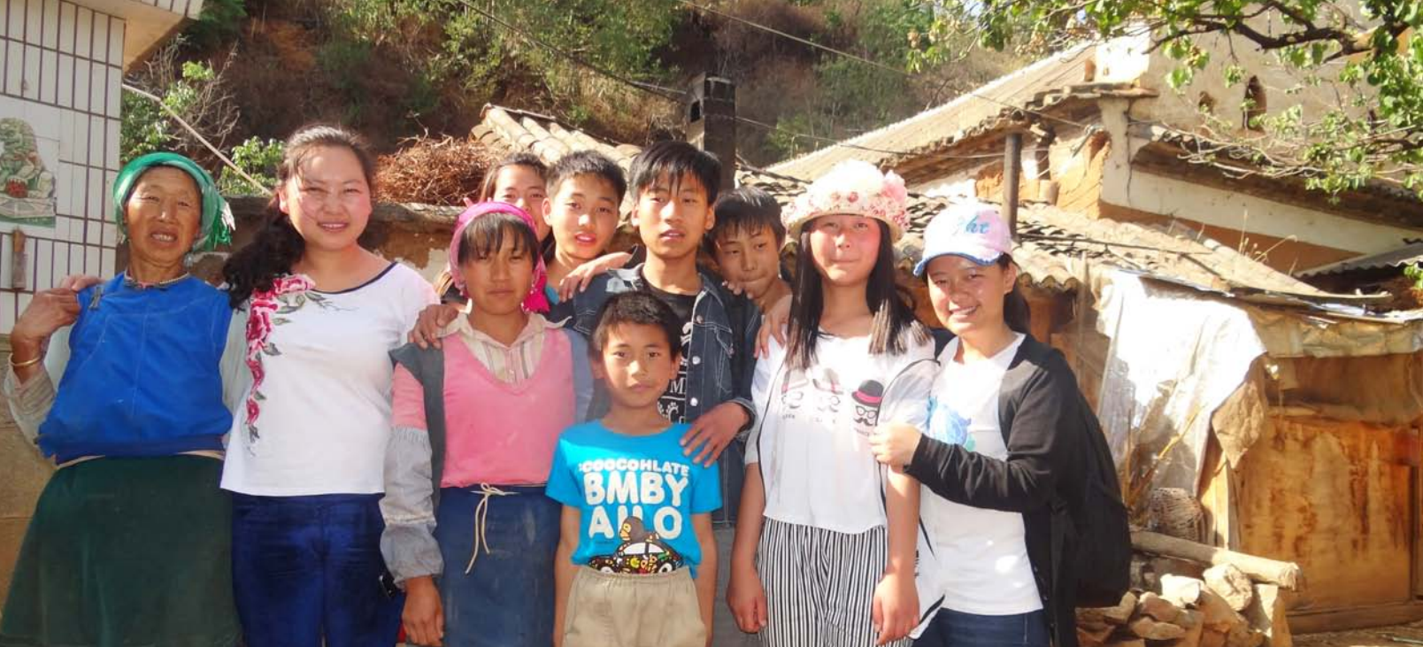
Badi Foundation and staff from a local community-based organization visit a local community in Dali City, Yunnan Province