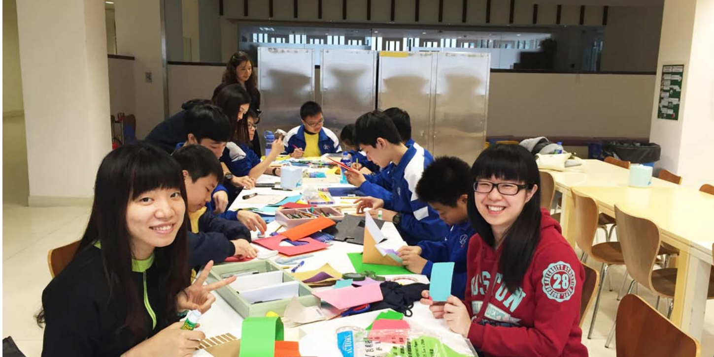
Members of the Macau Pooi To Service Team carry out an arts activity