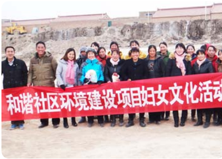
Xiji County, Ningxia Hui Autonomous Region initiate a cultural enhancement project in their community