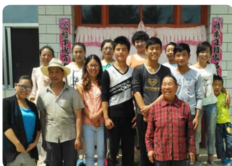
Animators in Lintao County, Gansu Province carry out visits to the homes of junior youth

"In the service team, for almost 7 months, I didn't just learn English words and English texts, more importantly, I learned about unity and mutual support and assistance. I learned to have a selfless and sincere heart to approach others. I learned universal love and how to take action to help those people around us that are in need of help, care and consideration."