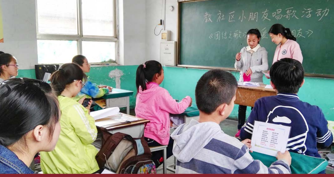
Junior youth from Zezhou County, Shanxi Province teach a song to their class