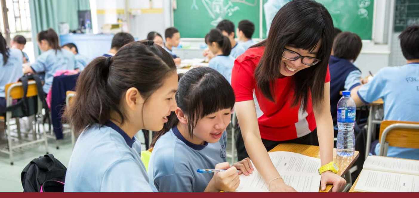
Students at Taipa Fong Chong School study the Moral Empowerment through Language Program materials