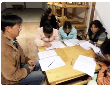
Rural women in Lijiang City, Yunnan Province study Environmental Action Program materials