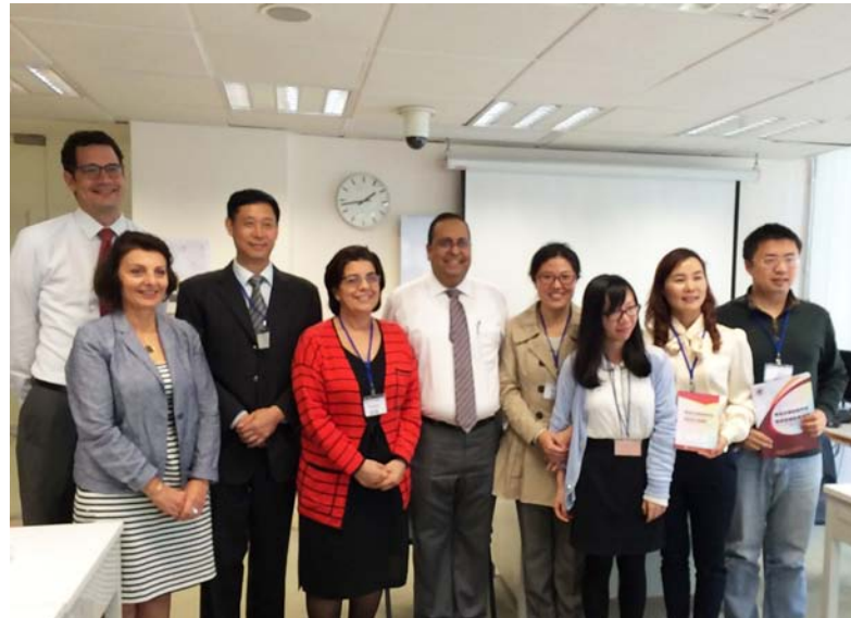
A delegation from the Shenzhen Nanshan Arts and Sciences Experimental School in Shenzhen City, Guangdong Province visits the School of the Nations

The activities the SON students carried out together with their younger contemporaries at Jin Hong School allowed the students to express their understandings of meaningful concepts in creative and artistic ways, and allowed for mutual participation in unity-building processes. Additionally, the Jin Hong Service Club organized activities that aimed to develop a greater understanding between the SON and Jin Hong students related to the importance of youth contributing to the betterment of their communities, while developing a global vision to go together with local action.