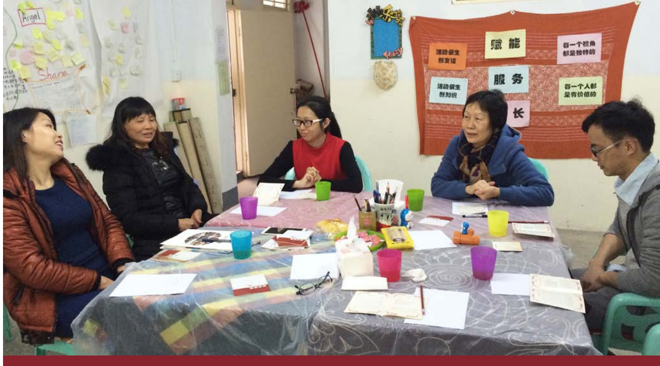
Parents and teachers of junior youth in Shantou City, Guangdong Province consult together

The progress of each project and the use of allocated funds was monitored through on-site visits by Badi Foundation staff members and kept track of via detailed financial reports to representatives of the Badi Foundation and CCF.