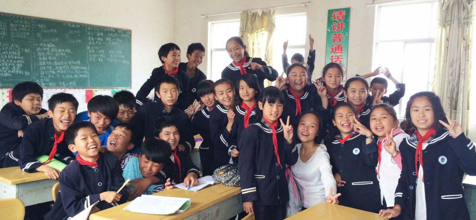
Junior youth and animators in Midu County, Yunnan Province