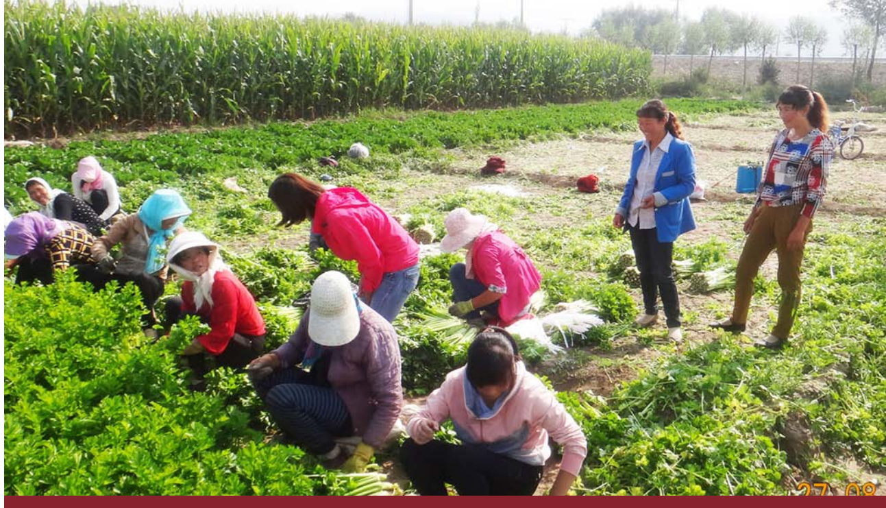
Rural women in Xiji County, Ningxia Hui Autonomous Region initiate an agricultural production support group