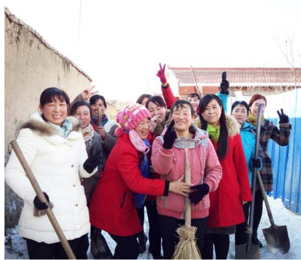
Pingliang City, Gansu Province initiate a service project to clean their village

development efforts, the villagers have sought to improve water distribution through the repair and maintenance of irrigation canals. Furthermore, the programs of the organization have progressively expanded to a wider range of communities.