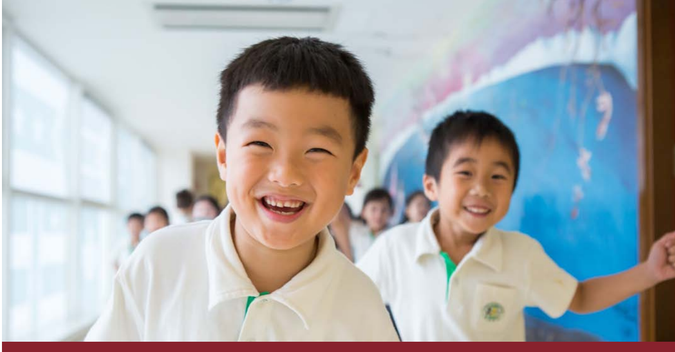
Kindergarten students at the School of the Nations