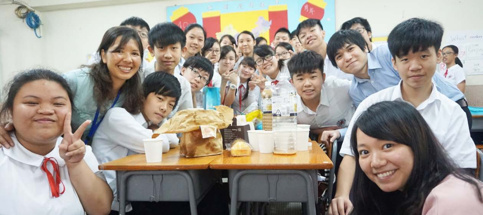
Participants of the Moral Empowerment through Language Program at Macau Pooi To School