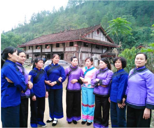
Rural women in Debao County, Guangxi Zhuang Autonomous Region form a community choir