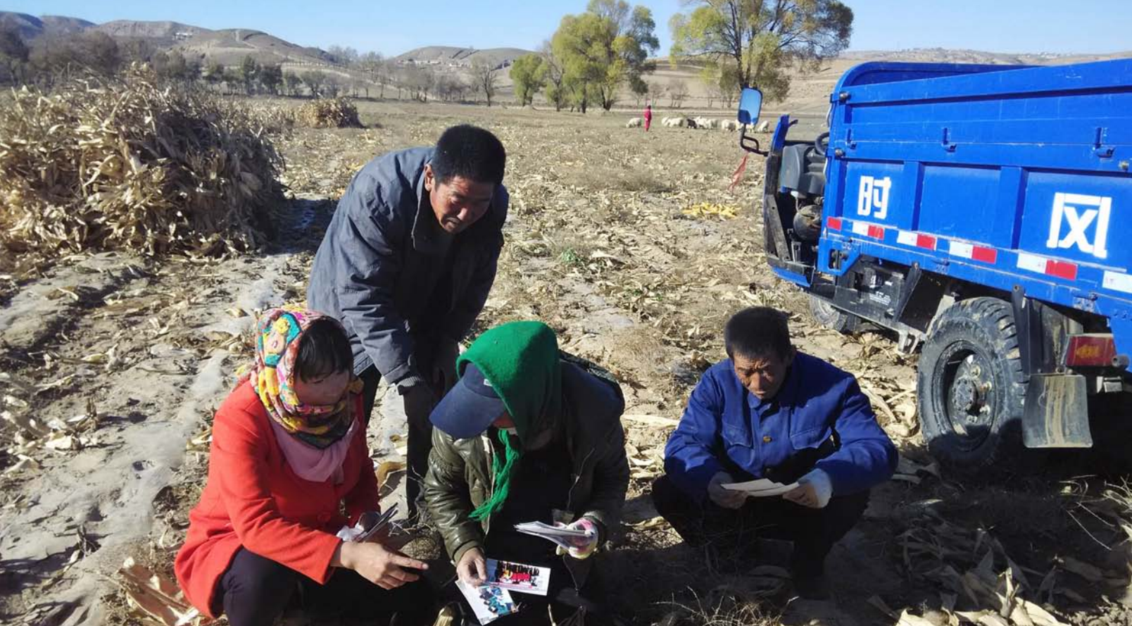
An EAP program facilitator Dingbian County, Sha'anxi Province visits program participants at their home

the Environmental Action Program has reached 15,625 individuals. With respect to the quality of the program, collaborators have organized and participated in a growing number of community development activities, including sustainable agricultural projects. It is heartening that through these small scale economic projects the villagers are consciously striving to ensure that the economic benefits extend to the community members at large.