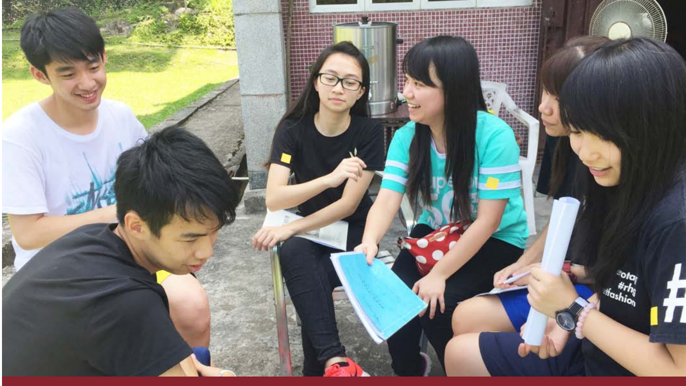
Facilitators at youth volunteer training camp organized by the Badi Foundation and the Macau Education and Youth Affairs Bureau