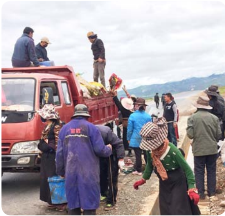
Yulong County, Qinghai Province program participants carry out a service project to protect the grasslands