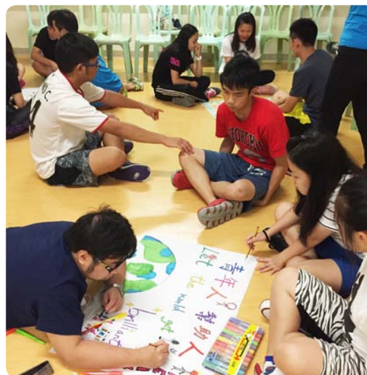
Youth participate in a summer workshop carried out by the Badi Foundation and the Macau Education and Youth Affairs Bureau

This year in both Macau Pooi To Middle School and Fong Chong Middle School, the foundation was happy to have the opportunity to organize workshops with teachers for study, reflection and consultation about the education of junior youth and key concepts of the Moral Empowerment through Language Program.