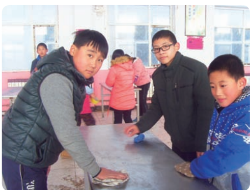
Junior youth in Zezhou County, Shanxi Province initiate a project to clean up their school

"In 2015, I came to the organization and became an intern...During these two months, joining the junior youth together in all that they experienced became the most beautiful feature of my life. Only through love, patience, forgiveness, understanding, communication and trust can we water these saplings that they may grow upright, happy and flourishing."