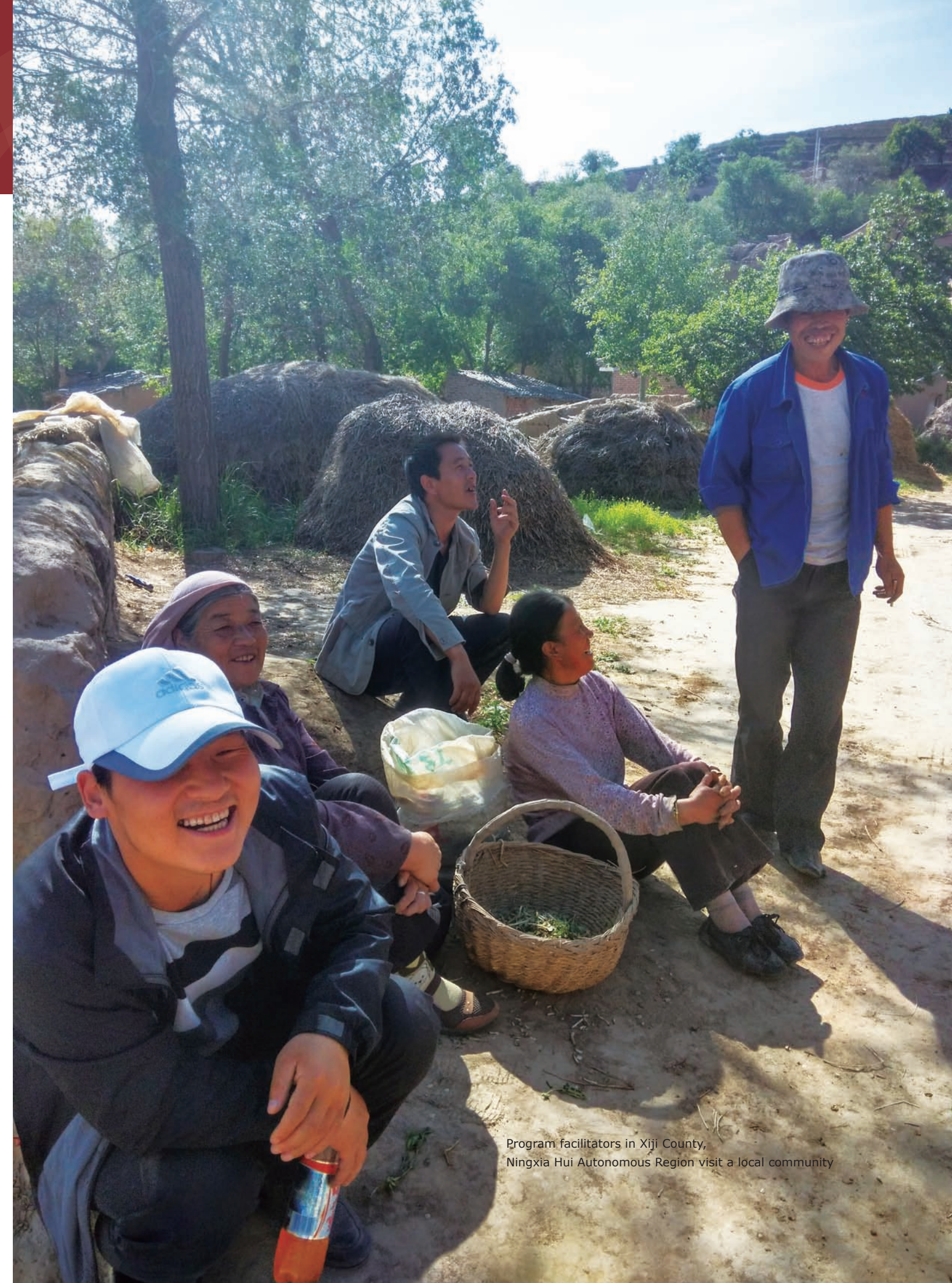
Program facilitators in Xiji County, Ningxia Hui Autonomous Region visit a local community