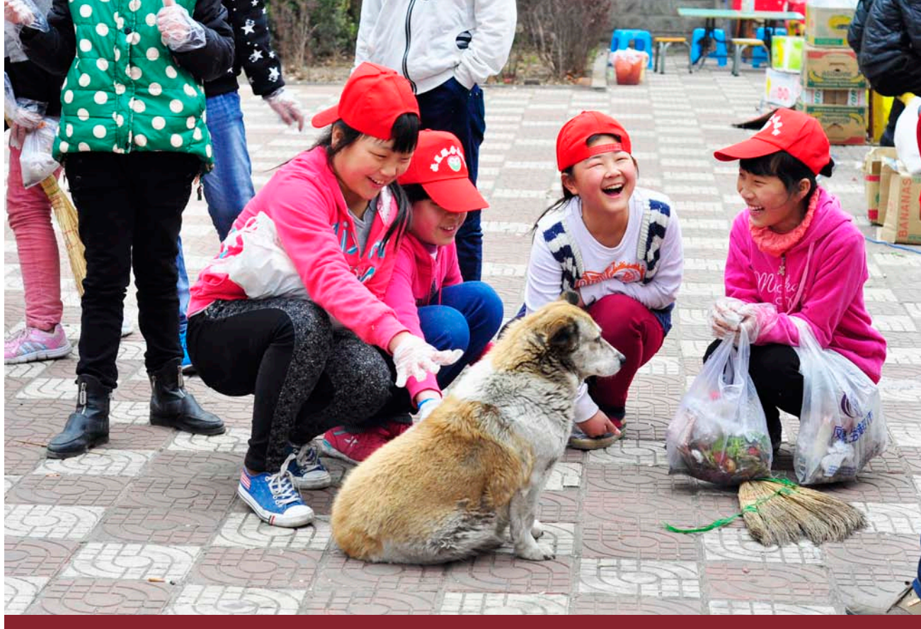
Junior youth in Zezhou County, Shanxi Province carry out a service project to clean up the community

The foundation continues to maintain ongoing dialogue and communication with such institutions as China Poverty Alleviation and Development Center of the State Council Leading Group Office of Poverty Alleviation, Tsinghua University's NGO Research Department, and the UN Women's representative office in China, to explore themes such as the equality