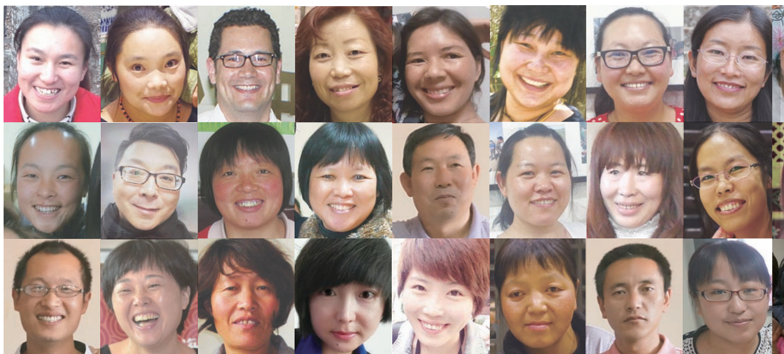
Badi Foundation staff and CBO initiators