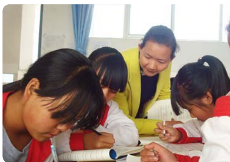
Animators in Dali City, Yunnan Province study together with junior youth