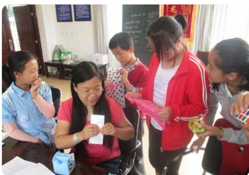
Animators in Lijiang City, Yunnan Province carry out an art project with junior youth